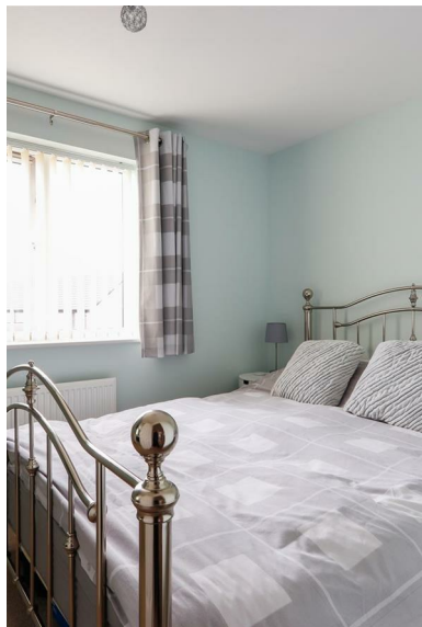
Ffordd Y Mileniwm, Barry